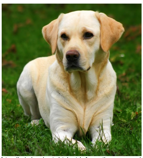
The gentle and friendly Labrador is high-risk for epilepsy, a result of in-breeding.

Animals Asia supports this scheme and encourages all kennel clubs globally to develop and operate schemes based upon this model, as well as promoting the development of responsible dog ownership for all dogs.