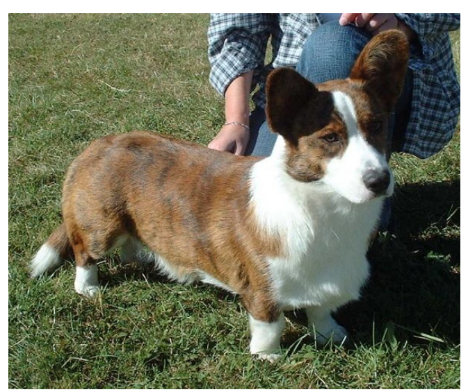
Cardigan Welsh Corgis can suffer blindness at an early age and back and hip problems.

In 2009, following media exposure of the wide-ranging health issues and subsequent welfare implications which affect many dog breeds, the Kennel Club (UK) completed a review for each of the 209 UK registered pedigree dog breeds and announced revised standards to benefit their health and welfare. The overall aim of these standards is to ensure that all pedigree dogs are fit for function and breeders and judges are requested by the Kennel Club not to reward dogs with obvious conditions or exaggerations, which would be detrimental in any way to their health.