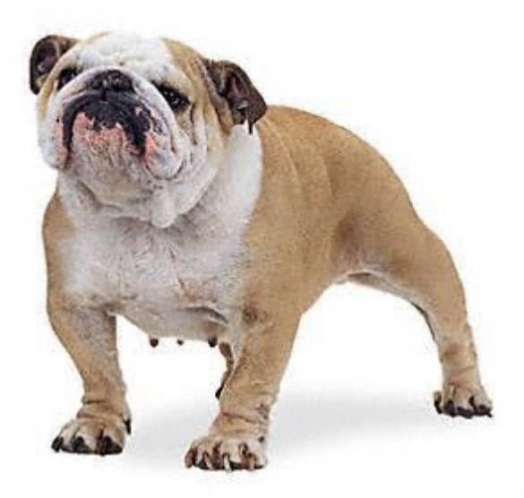
The English Bulldog, whose head is too large to birth naturally, also suffers from hip, heart and skin problems.

The general promotion of purebred dogs and the desire to breed animals for specific physical and behavioural traits by many dog breeders has lead to significant health and welfare problems in many breeds. In addition to this the emphasis on pure breeds can cause or exacerbate disrespect for mixed breed animals within a community.