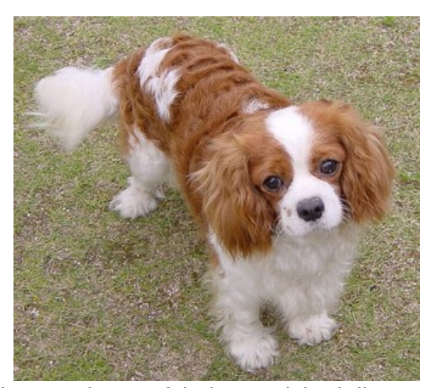
A hereditary mismatch between the size of the brain and the skull causes the Cavalier King Charles Spaniel excruciating head and neck pain.

Animals Asia supports steps such as the creation of the Accredited Breeder Scheme which can improve the overall health and welfare of purebred dogs, we encourage the UK Kennel Club to continue to develop the Accredited Breeder Scheme by incorporating the recommendations of the Bateson inquiry to improve the health and welfare of all breeds and a duty of care for all breeders to be responsible for the health and welfare of parent dogs and puppies, and we encourage kennel clubs globally to follow this example and adopt rigorous health and welfare standards for registered breeders.