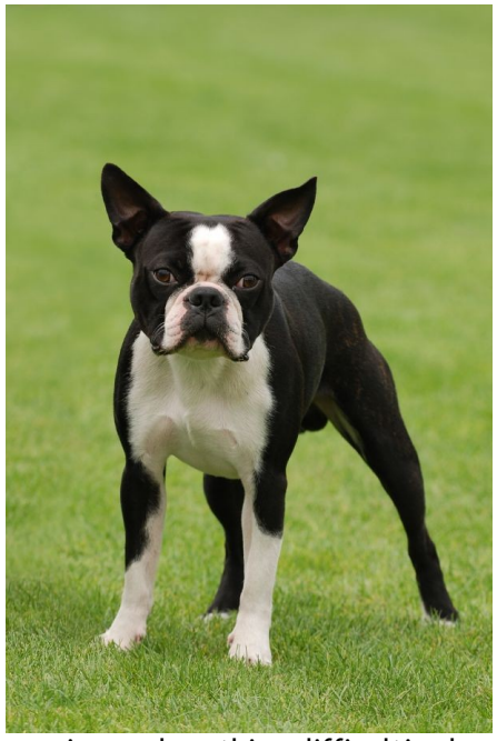
The Boston Terrier experiences breathing difficulties because of its flat face.